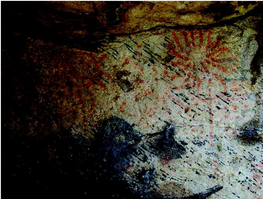
Fig. 2. Paintings from Pala Pinta interpreted as a cometary representation (left).

The topography of these rock art sites is “a mnemonic for the San cosmos” (Ouzman, 2010: 28), being also large spaces with abundant evidence of intense socialization, suggesting a culture centre of the San world. Interestingly, each site is located near deep waterholes or natural springs. According to San beliefs, “water provides an earthly anchor for heavenly bodies. Structurally, heavenly bodies have their origin in an upper spirit world. They then travel brightly and ominously through the sky before falling into a waterpit, which constitutes an earthly access to the underworld” (Ouzman, 2010: 29).